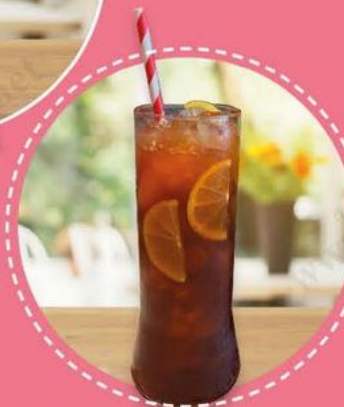
Thai Iced Tea with lemon $6.80