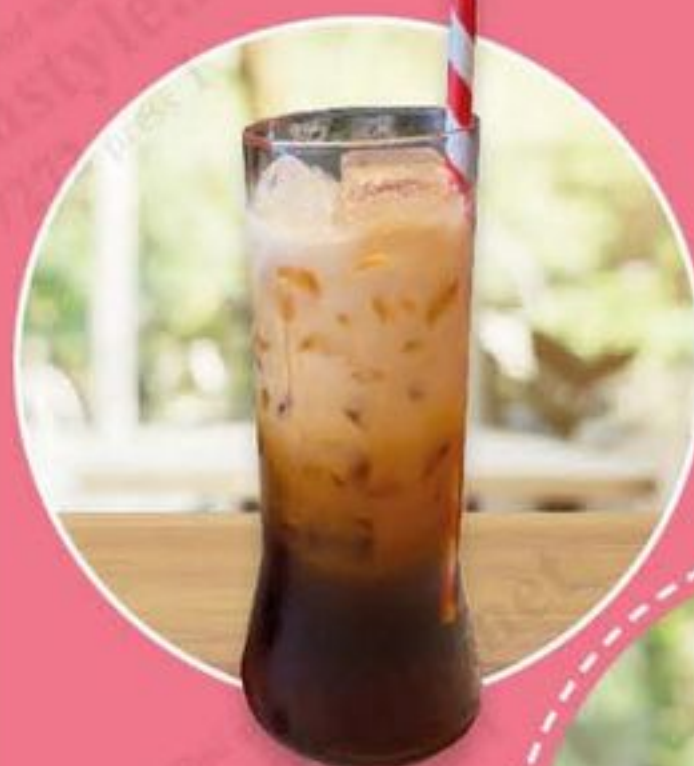
Thai Iced Tea with milk $6.80