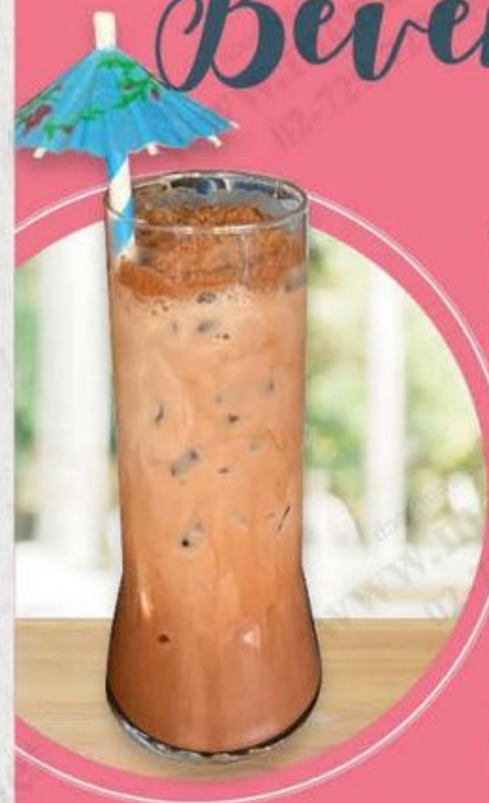
Thai Iced coffee $6.80